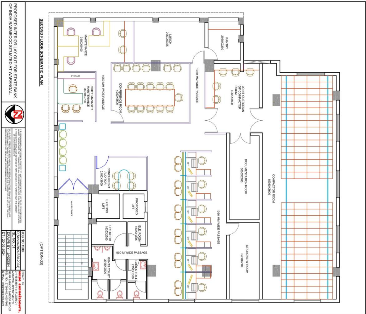
SECOND FLOOR SCHEMATIC PLAN